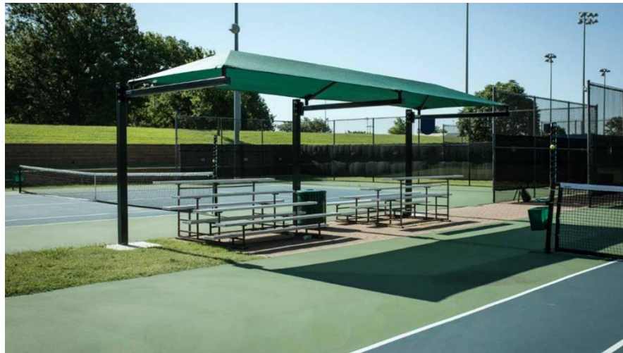
Example of Shade for Bleachers

Sevierville PARKS AND RECREATION So much more than a walk in the park,