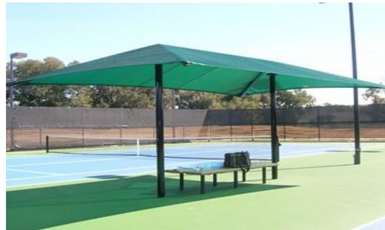
Example of Players Shade with Bench Seating